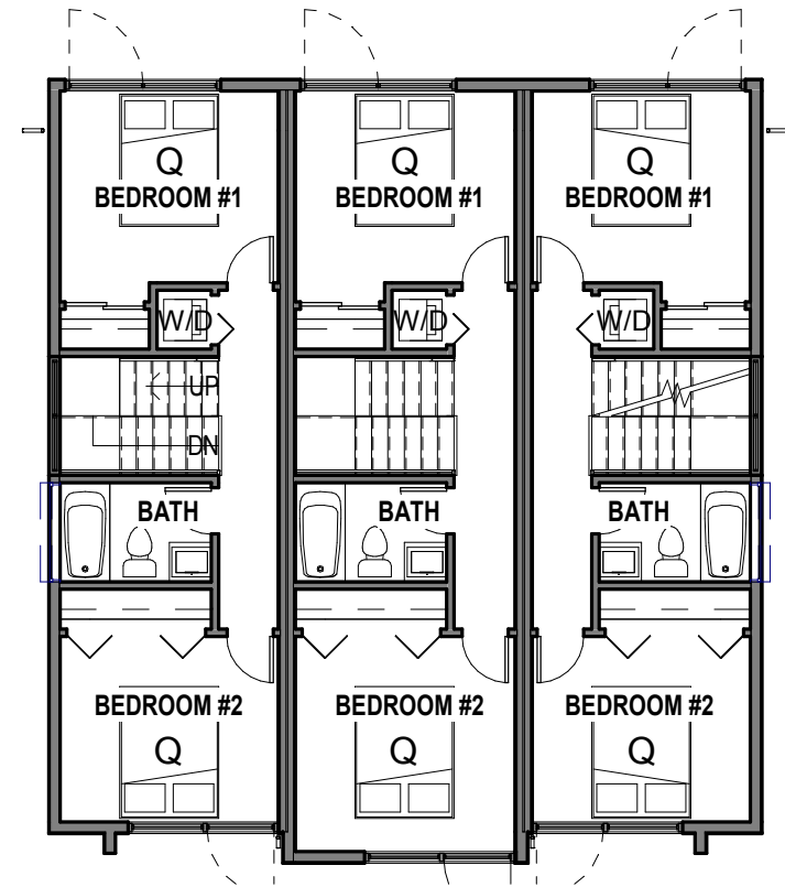
1 LEVEL 1 PLAN #1 :